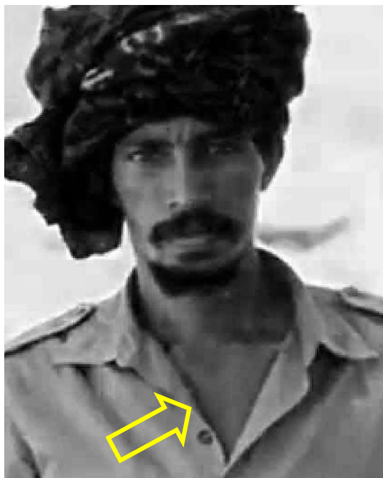
Non-T-shirt EPLF Political Commissar Bitwoded Abraha