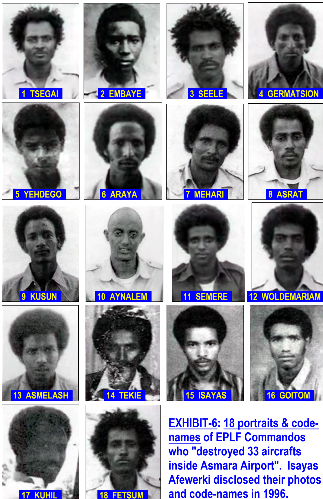
EXHIBIT-6: 18 portraits & code-names of EPLF Commandos who "destroyed 33 aircrafts inside Asmara Airport". Isayas Afewerki disclosed their photos and code-names in 1996.