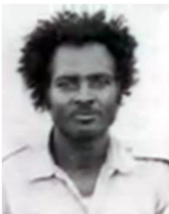
T-shirt COMMANDO #1 Tsegai