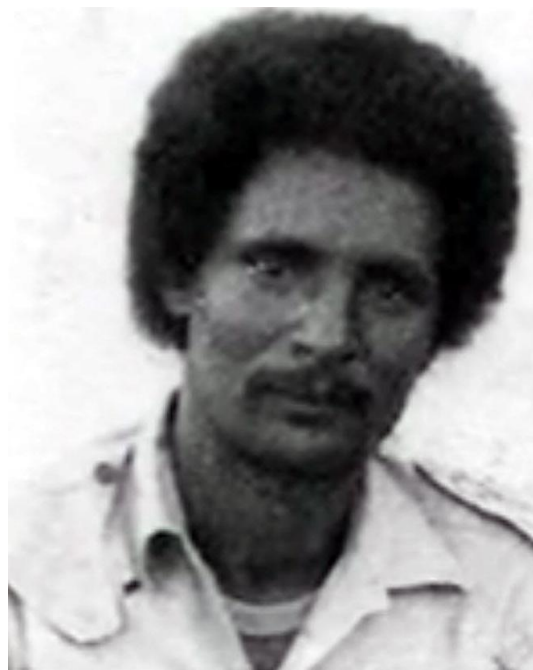
T-shirt Commando #7 Mehari