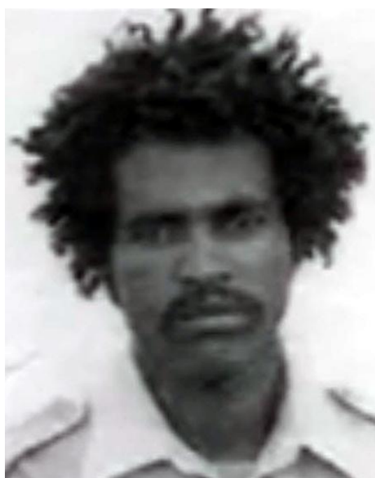
T-shirt COMMANDO #3 Seele