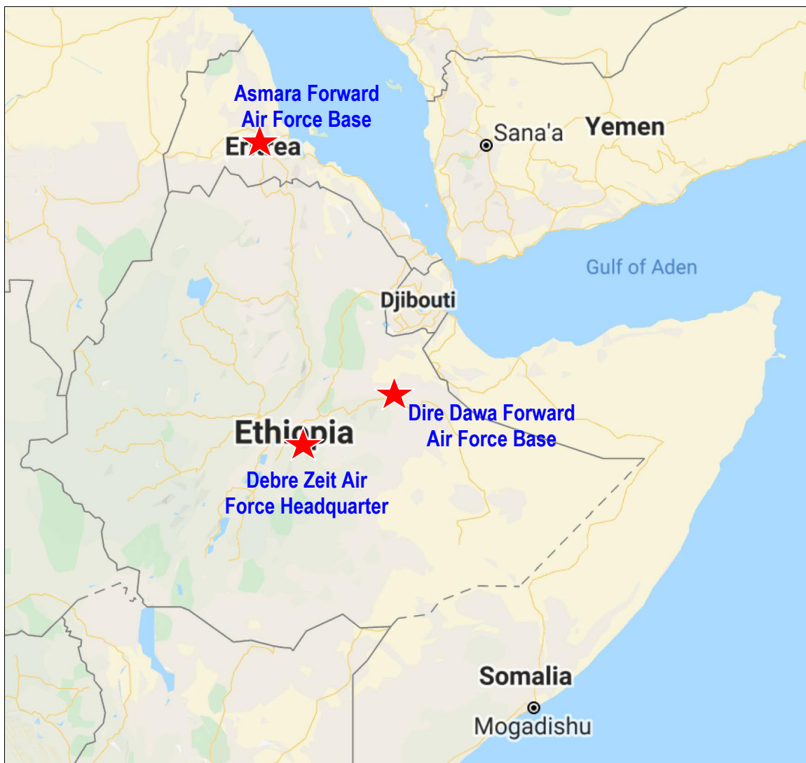
EXHIBIT-3: Ethiopia's Forward Air Base in Asmara and in Dire Dawa and Debre Zeit Air Force Headquarter.

In Eritrea, Ethiopia's Asmara Squadron was located in the Forward Air Force Base in Asmara at Yohannes IV International Airport.