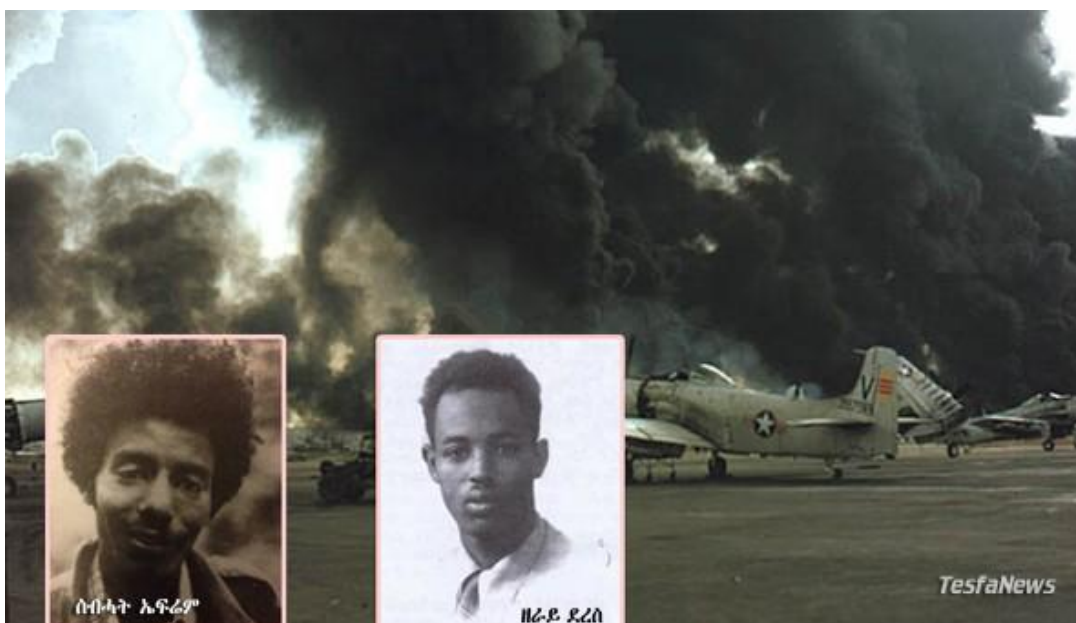
EXHIBIT-9: Spectacular operation by Viet Cong gorilla fighters at Bien Hoa Air Base, Vietnam, May 16, 1965, in which more than 50 American and Vietnamese airmen and ground crew were killed (Top). Pro-EPLF supporters forged the top image for the Commando Operation (Bottom).