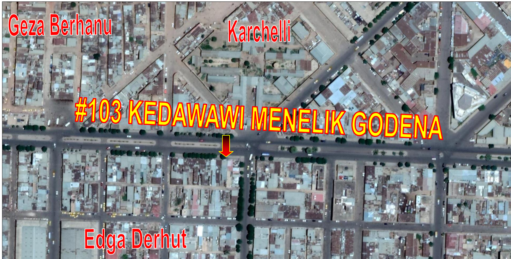
MAP #1 : Location of the Big House on Kedamawi Menelik Godena (ቀዳማዊ ምኒልክ ጎደና).