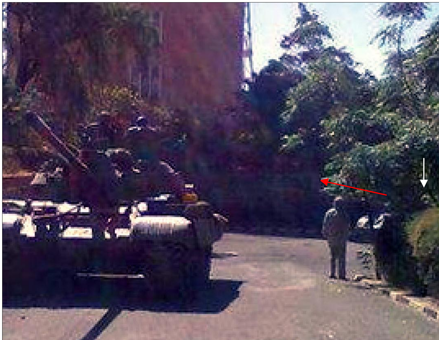
MISSING 2ND TANK LOCATED Tank gun is shown parallel & below the red arrow. The white arrow shows tank hatch cover.