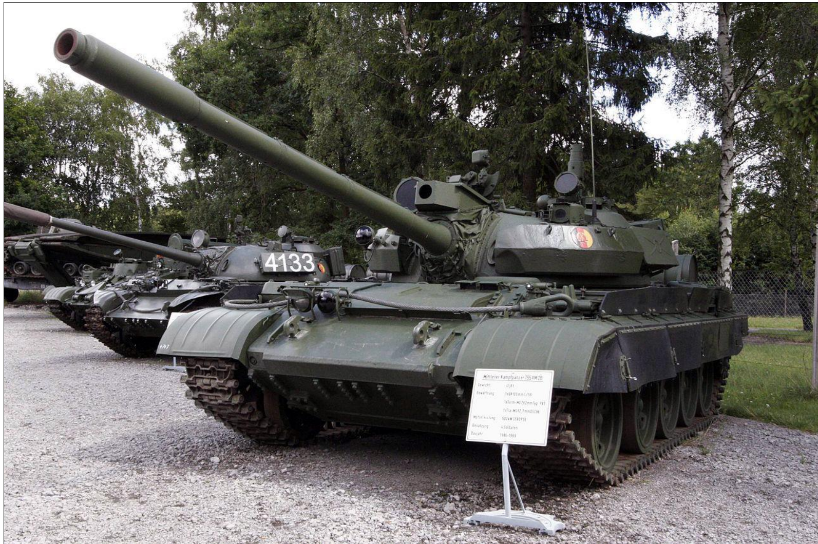
T-55 AM2B Russian made tank which is identical version to Colonel Seed Ali Hijay's tank. FRONTAL VIEW