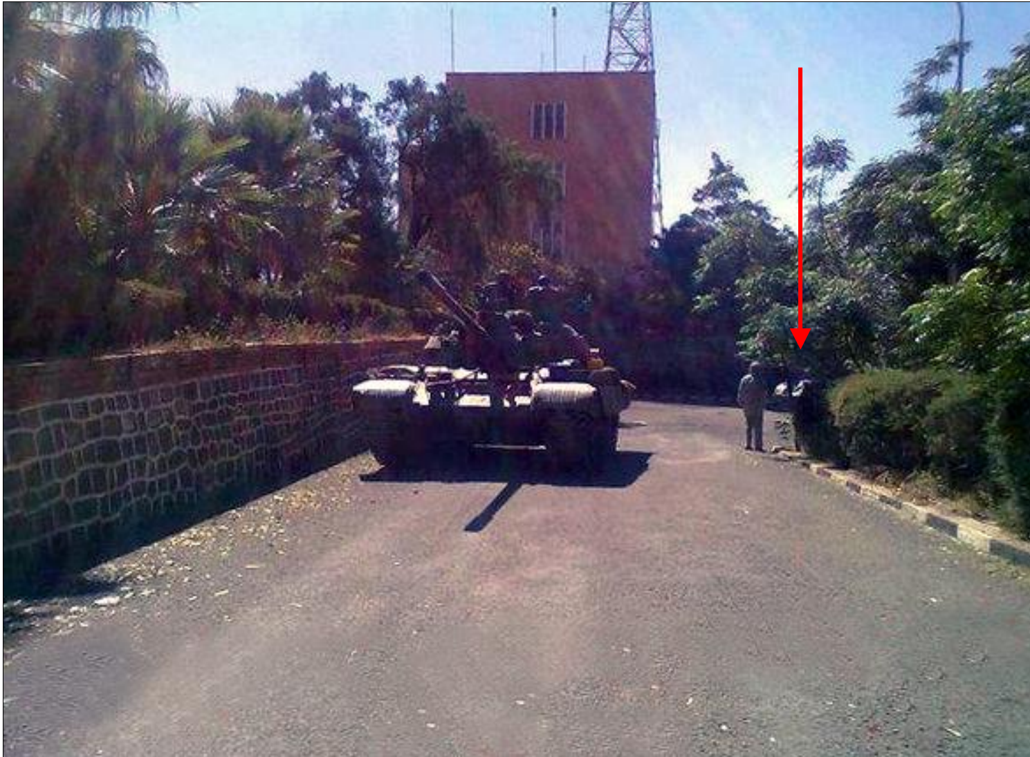
RED ARROW The missing 2nd tank of Forto Action is located on the background, among the vegetation thicket.