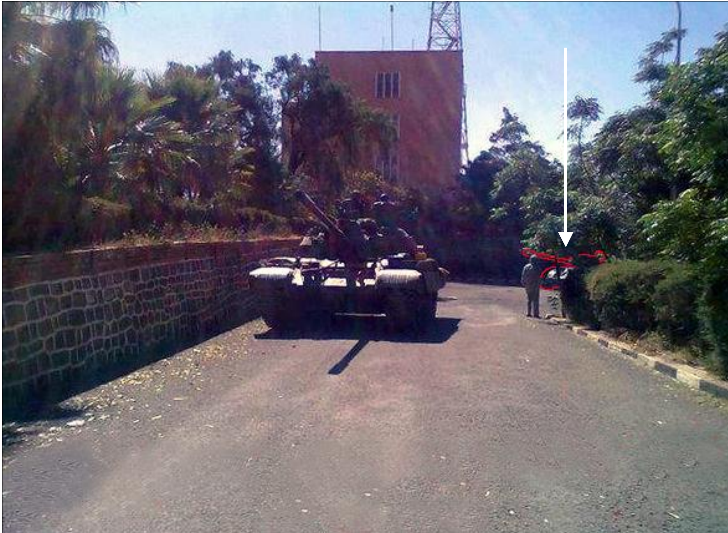
RED OUTLINE The missing 2nd tank of Forto Action is highlighted with an outline of red colour.