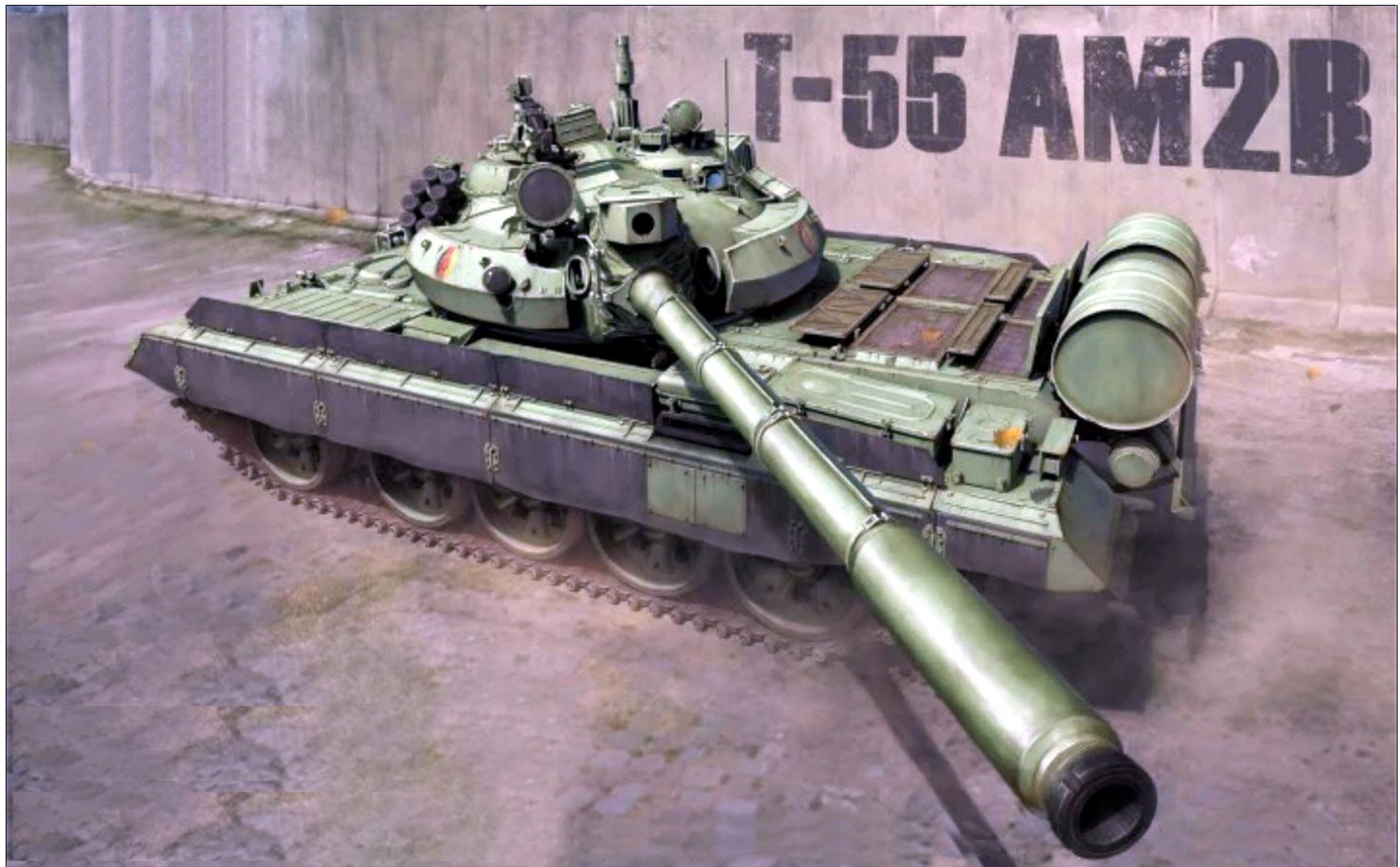
BIRD EYE VIEW and rear view of T-55 AM2B.