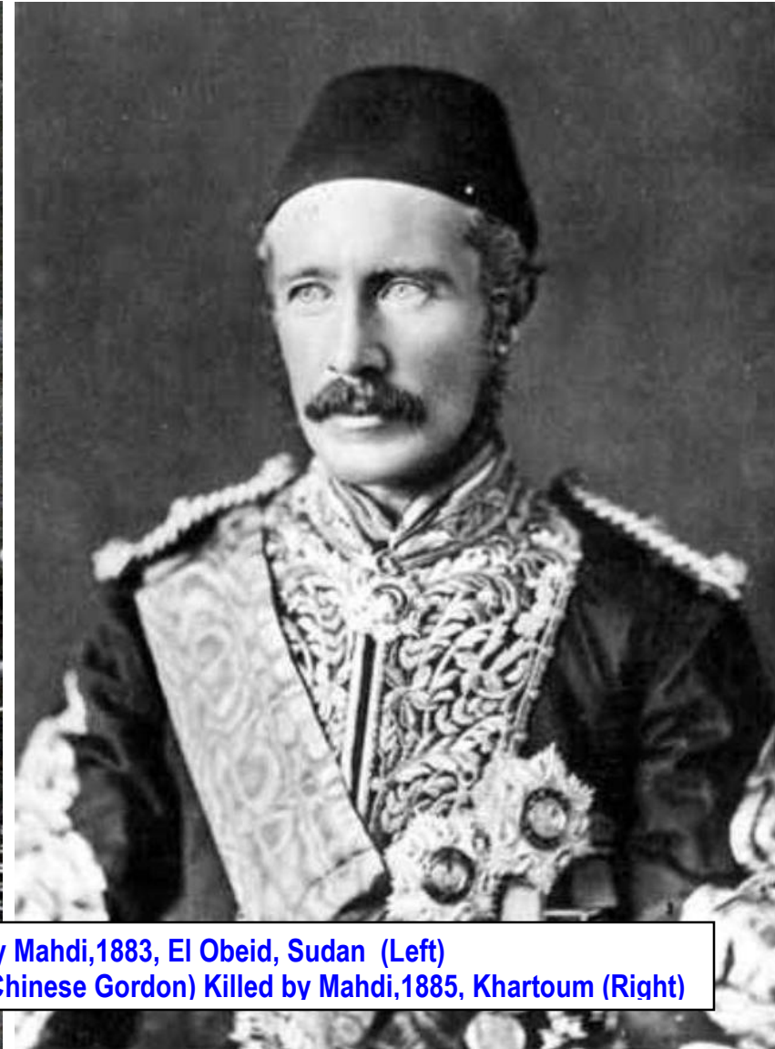
#15 Governor General Charles George Gordon (Chinese Gordon) Killed by Mahdi, 1885, Khartoum (Right)