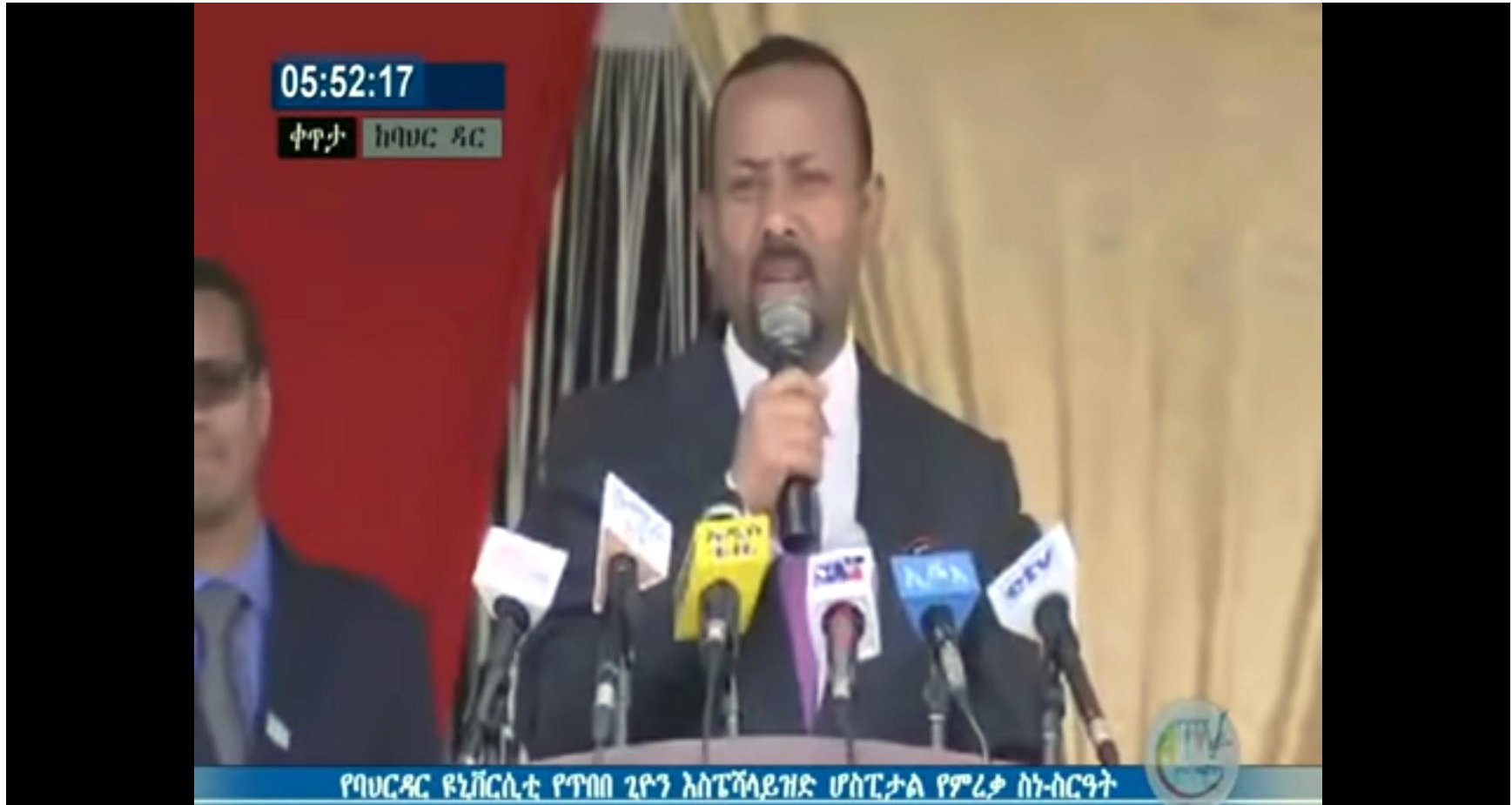
#4 Abiy Ahmed delivering BADO-3 hoax, “Gondar is the burial ground of Isayas’s grandfather.”