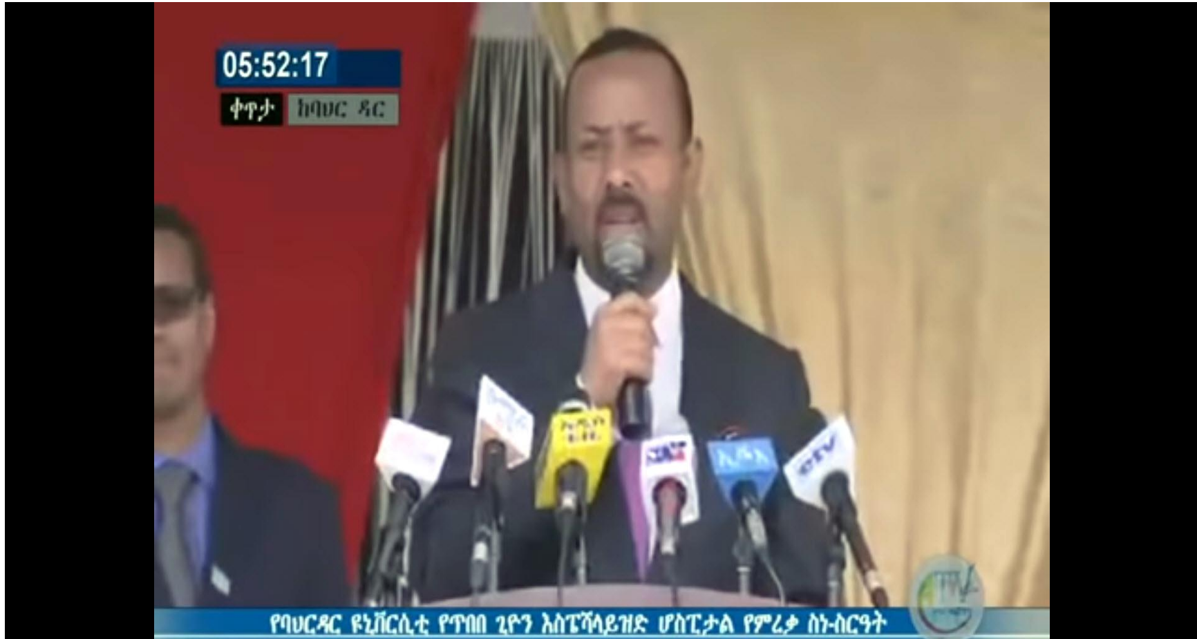
#4 Abiy Ahmed delivering BADO-5 hoax, “Gondar is the burial ground of Isayas’s grandfather.”